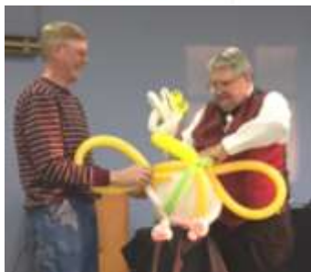
Family Fun Night